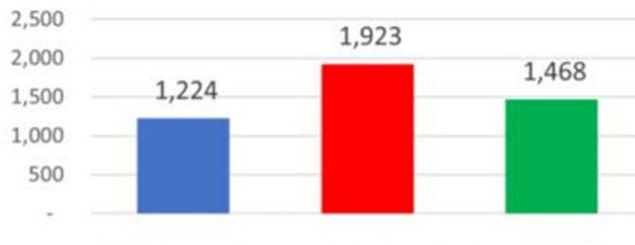
Individuals Served by Collaborative Programs in 2020